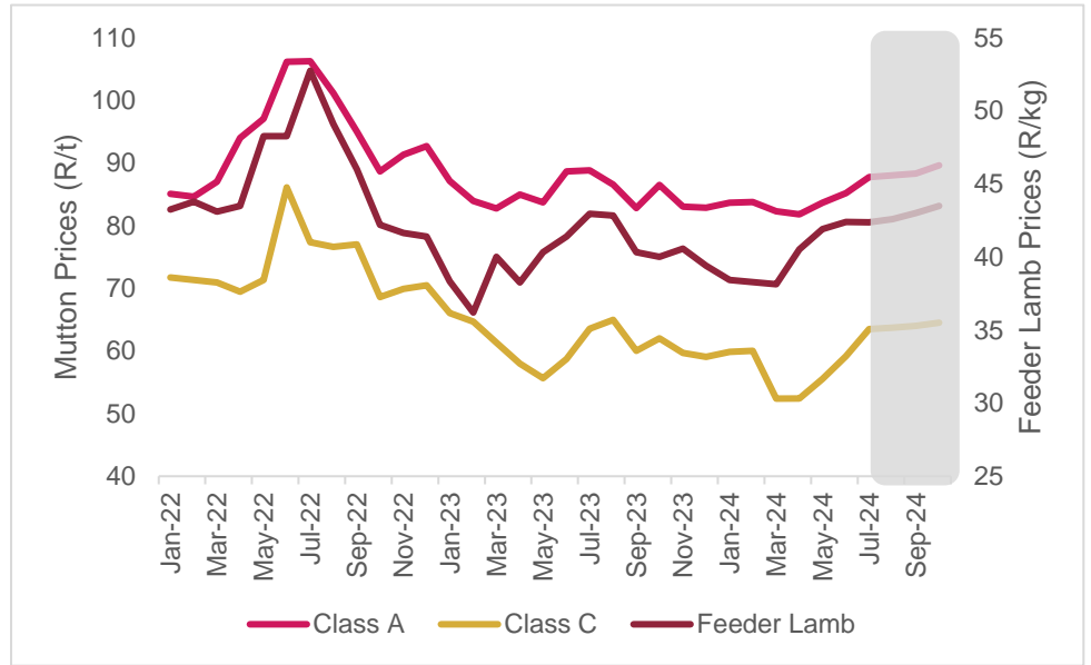
Figure 2: Local sheep prices

*Area in grey represents Absa AgriBusiness forecasts