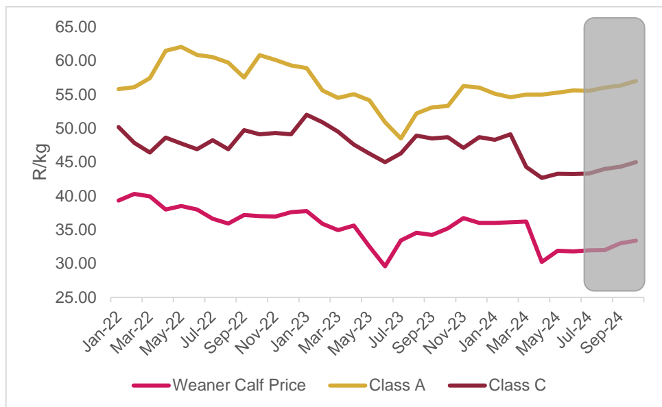
Figure 1: Local beef and weaner calf prices

*Area in grey represents Absa AgriBusiness forecasts